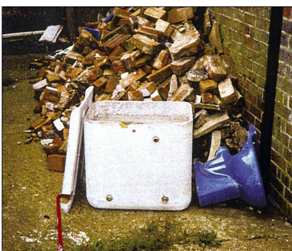
An AC water tank